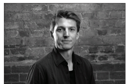
↑ The hall's double-height ceilings, timber interior and acrylic reflectors all enhance the acoustics

The Amadeus system uses a mix of Renkus-Heinz and Atlas Sound speakers