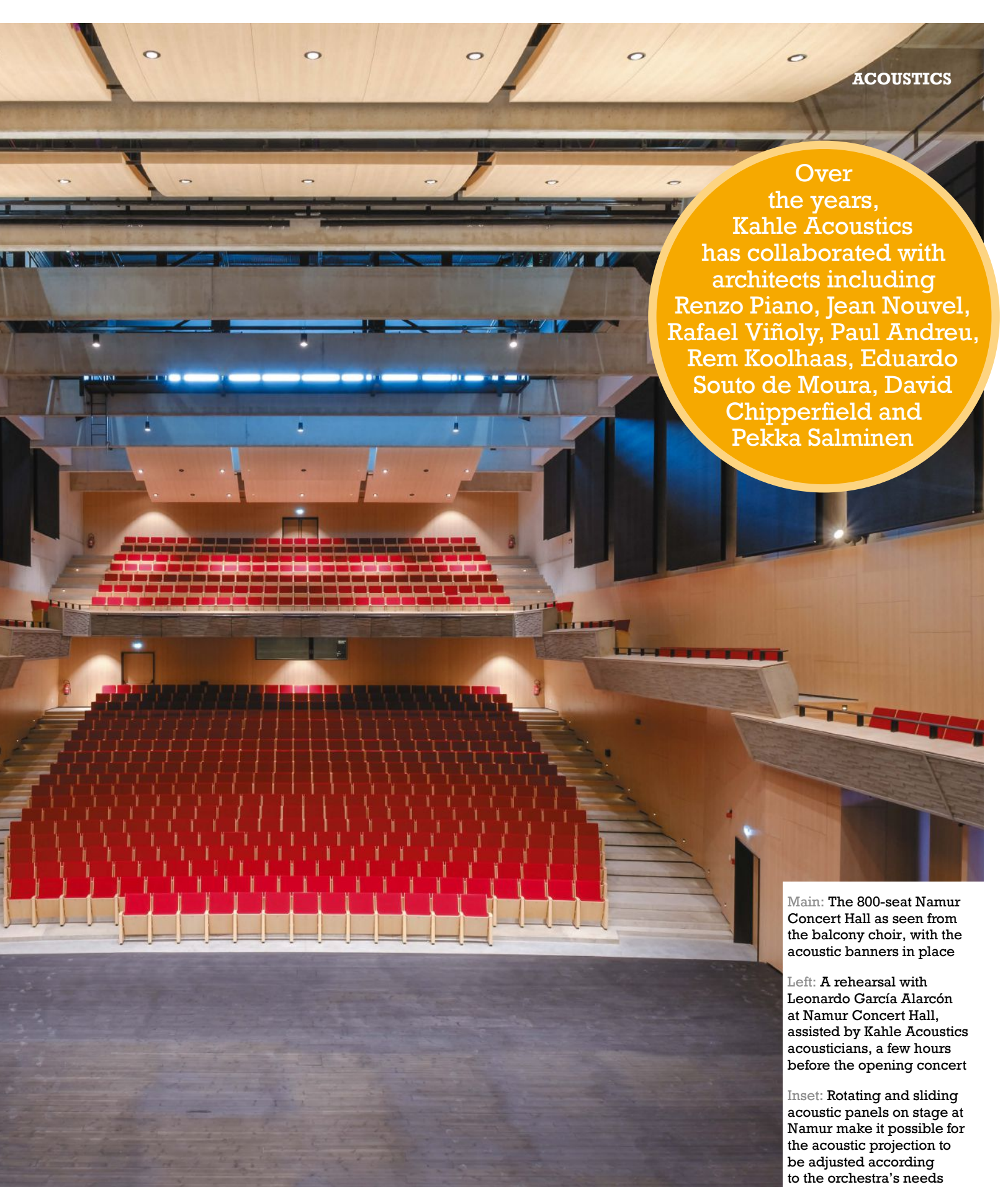
Main: The 800-seat Namur Concert Hall as seen from the balcony choir, with the acoustic banners in place

Over the years, Kahle Acoustics has collaborated with architects including Renzo Piano, Jean Nouvel, Rafael Viñoly, Paul Andreu, Rem Koolhaas, Eduardo Souto de Moura, David Chipperfield and Pekka Salminen